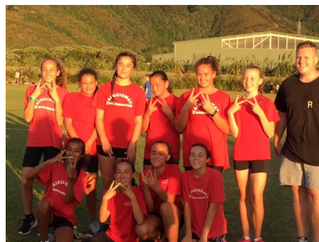
Girls A Touch Team

Respect Responsibility Rigour Striving for Excellence