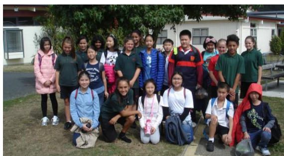
Welcome to our 11 Thai students, pictured above with their buddies, attending our school until 11 April.

If you are interested in becoming a school trustee please contact the school for a copy of A Parent's Guide to the role of the Board of Trustees booklet or visit http://www.trustee-election.co.nz/becoming-a-trustee for more information.