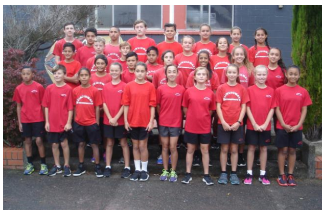
2016 Athletics Team