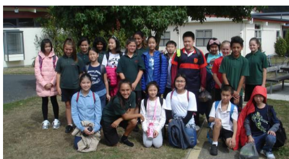
Welcome to our 11 Thai students, pictured above with their buddies, attending our school until 11 April.

If you are interested in becoming a school trustee please contact the school for a copy of A Parent's Guide to the role of the Board of Trustees booklet or visit http://www.trustee-election.co.nz/becoming-a-trustee for more information.