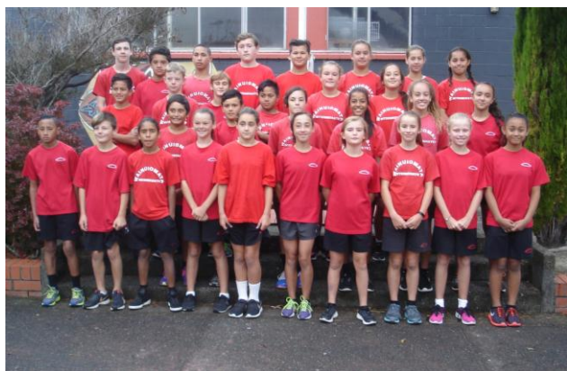
2016 Athletics Team