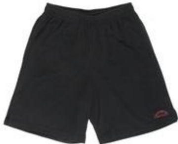
PE Shorts Optional $27.00