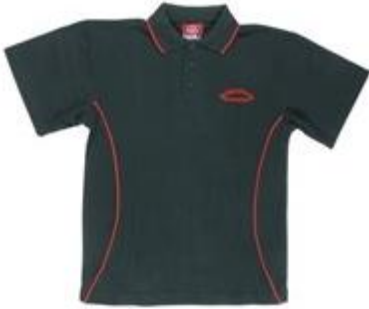
Unisex Green Polo Shirts Compulsory $29.00