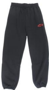
Trackpants Optional $54.00