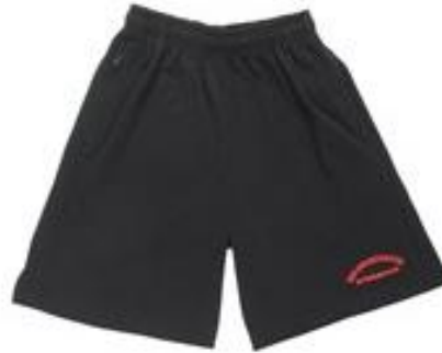
Unisex Shorts Compulsory $36.00