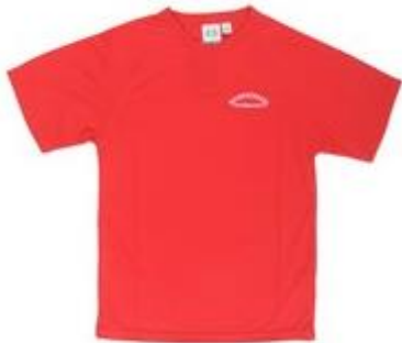
PE T-Shirt Compulsory $31.00