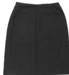
Girls Skirt Optional $53.50