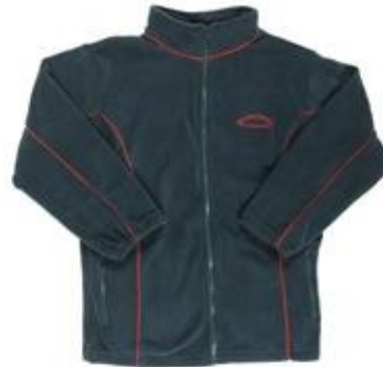
Unisex Polar Fleece Jacket Optional $67.50